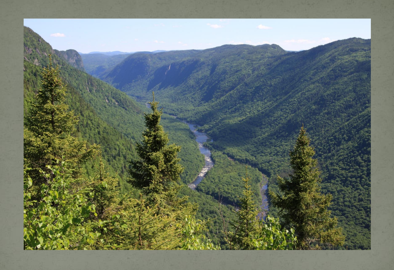
Show the forest – not just the trees