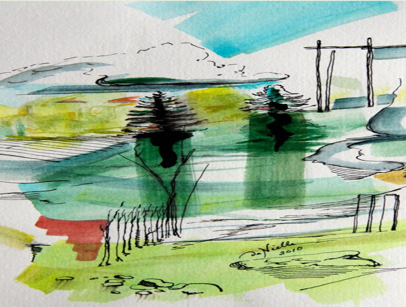
River Valley Soup (2010)

Danielle LaBrie Watercolour and Chinese ink on paper, 28.5 cm x 14.5 cm