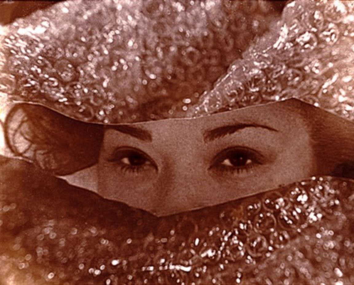
Untitled (2006) Harmony Ráine Photomontage (silver gelatin print), 8" x 10"