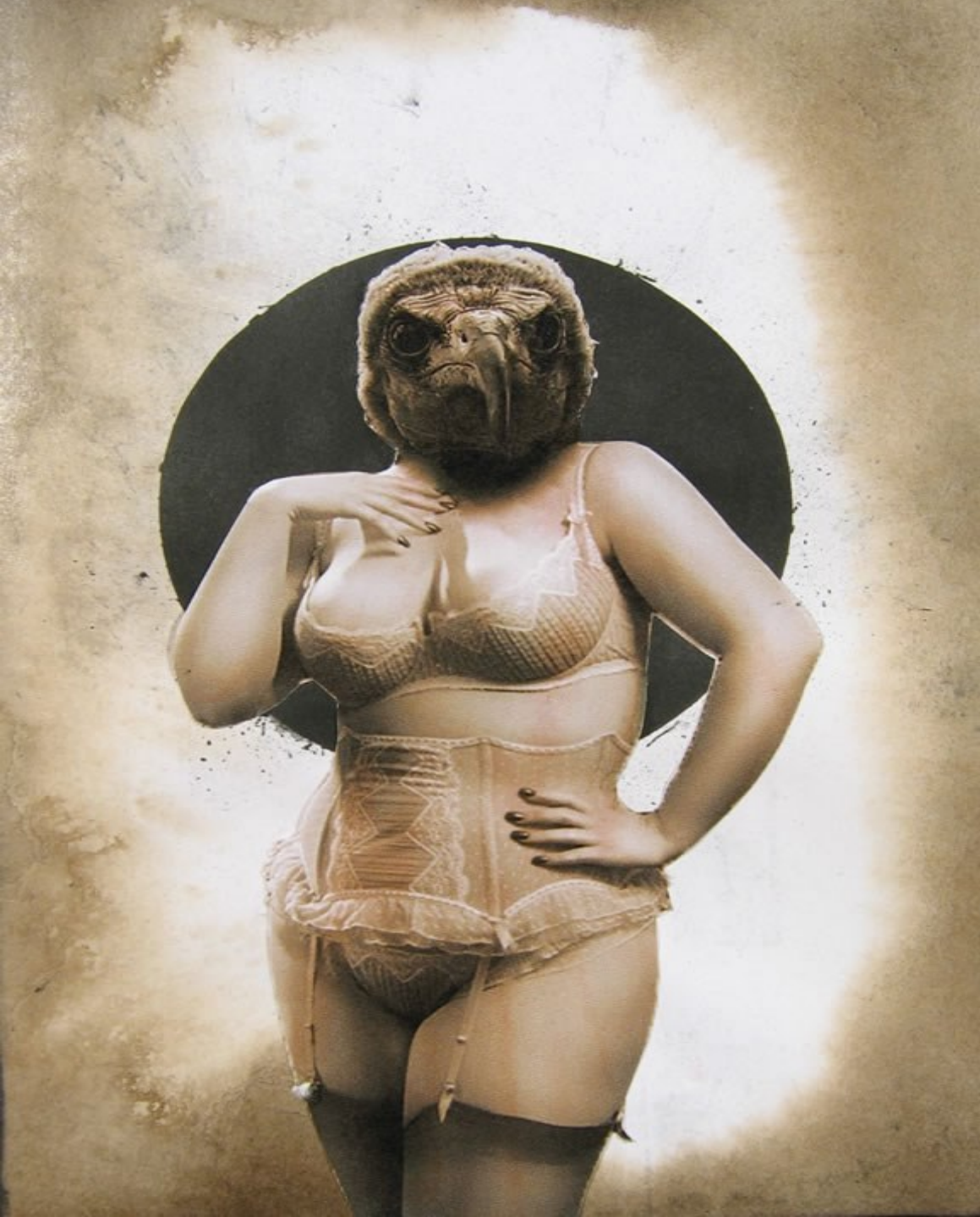
Vulture pin-up (2011) Mark Bizner mixed media collage, 7" x 5"