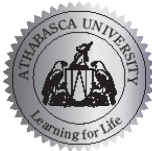
Registrar Official Signature